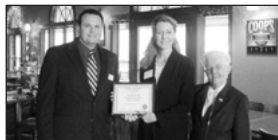
Welcome Church of Scientology as a new member to the Chamber