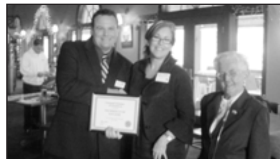
New member, Techskills, accepting their new member plaque.