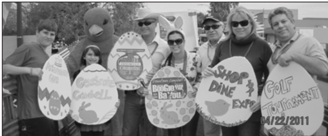
Our "Event Eggs" at the Easter Parade in Downtown Campbell