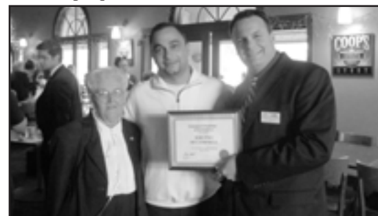
Servpro is a new member of the Chamber.