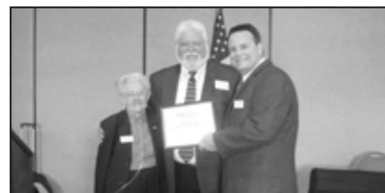
West Coast Collection Agency is a new member of the Chamber